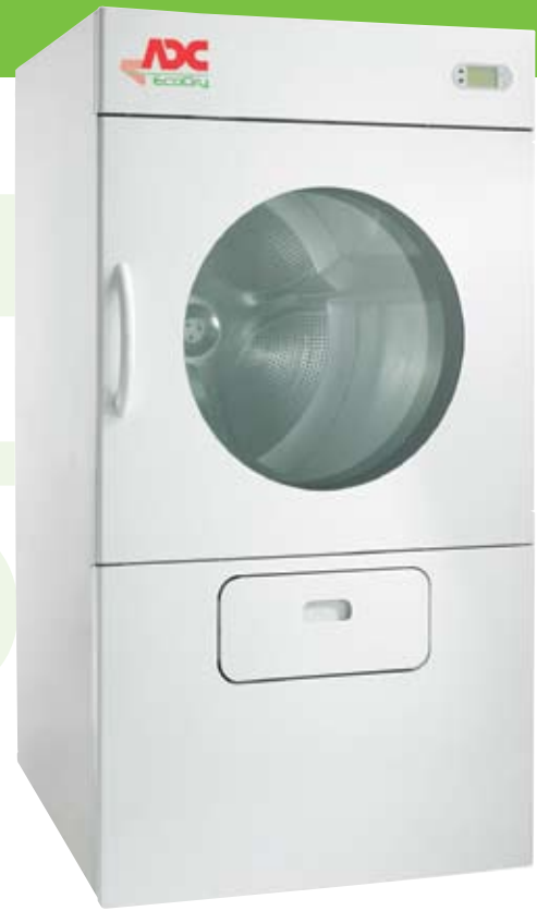
ES-76 OPL Dryer